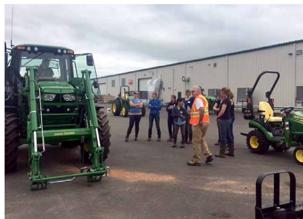
Nine women took part in this hands-on workshop held in Lower Onslow in July. Participants had the opportunity to practice operating a variety of equipment—some they had previous experience with and some new.

We were very excited to provide this opportunity and look forward to improving on this workshop for