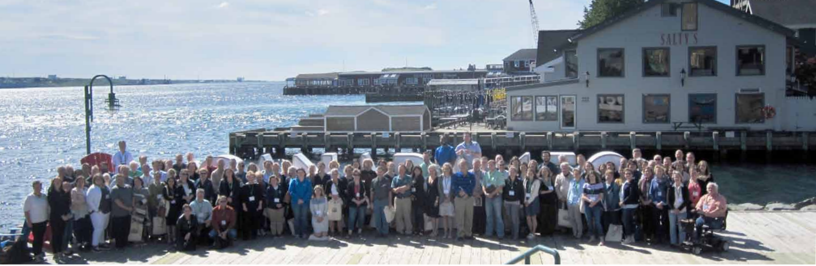
ISASH participants enjoying the Halifax boardwalk!